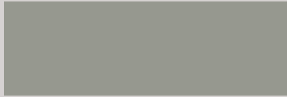
GRAY READY MIXED